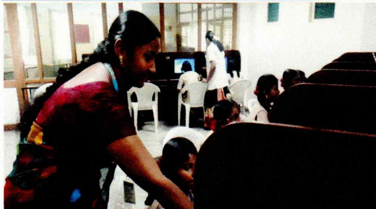
COMPUTER SKILL ORIENTATION PROGRAMME